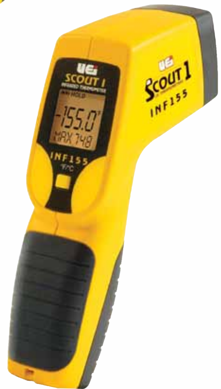
SCOUT I I.R. THERMOMETER