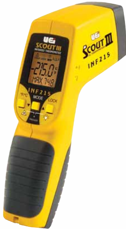
SCOUT III I.R. THERMOMETER