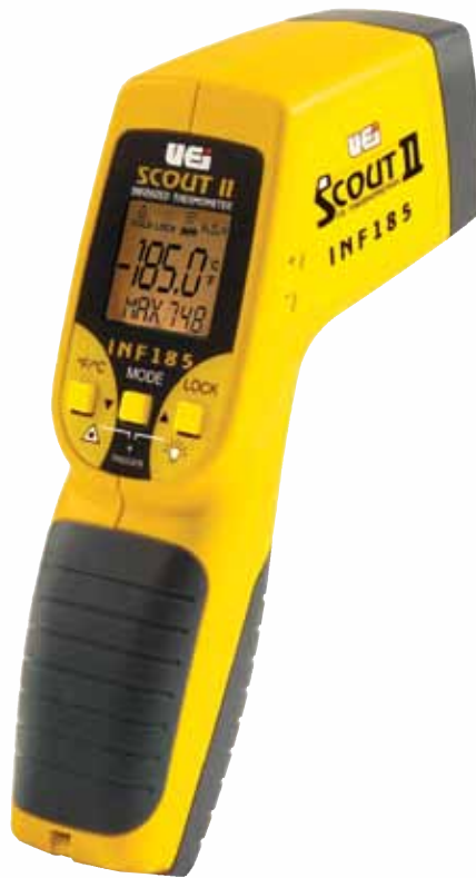
SCOUT II I.R. THERMOMETER